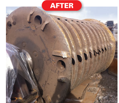
After 500,000 Tons with No Maintenance