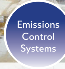
Emissions Control Systems

Shredder Enclosures with exclusive partner ILG International for noise reduction, occupational safety, stability, and durability. ILG enclosures are specifically designed to handle over-pressure events and the extreme environment around an auto shredder.