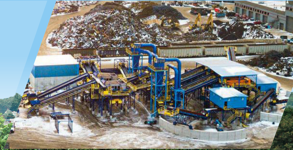
400+ TPH Ferrous Cleaning System (Low Copper)

WENDT's separation systems are configured to attain the highest quality ferrous shred. From simple downstreams designed for first-time operators to the most advanced design to achieve low copper shred with minimal labor, WENDT offers a wide range of state-of-the-art downstream solutions to fit any size shredder.