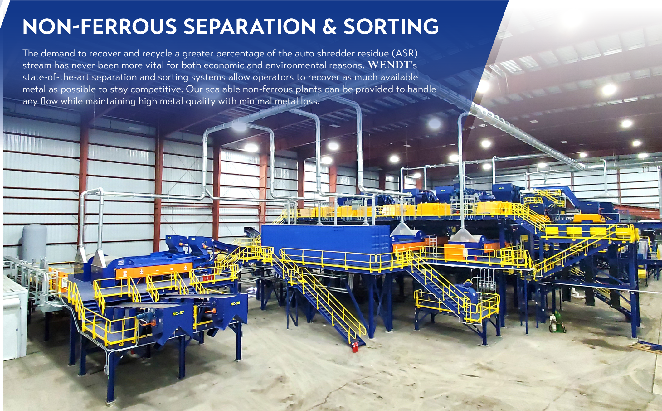
70 TPH Non-Ferrous Recovery Plant

The demand to recover and recycle a greater percentage of the auto shredder residue (ASR) stream has never been more vital for both economic and environmental reasons. WENDT's state-of-the-art separation and sorting systems allow operators to recover as much available metal as possible to stay competitive. Our scalable non-ferrous plants can be provided to handle any flow while maintaining high metal quality with minimal metal loss.