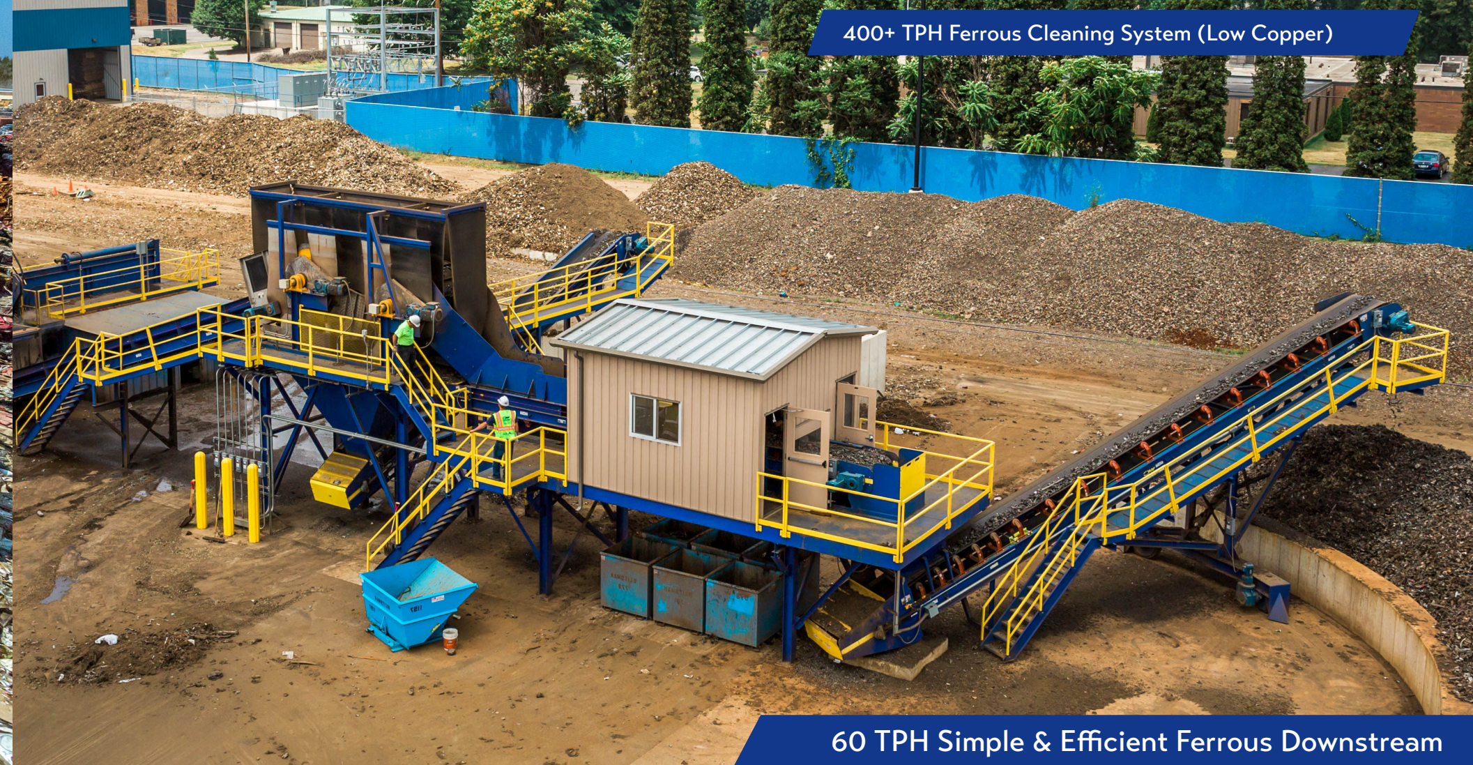
60 TPH Simple & Efficient Ferrous Downstream